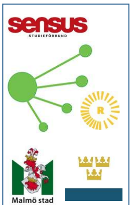
Malmö stad and other partners